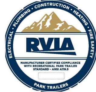
RVIA Recreational Park Trailer Label (new units)