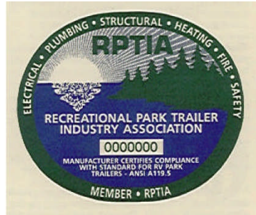
RPTIA Park Model Label (older units)