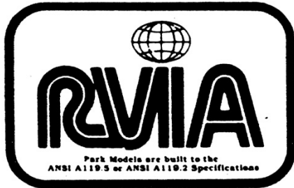
RVIA Park Model Label (oldest units)